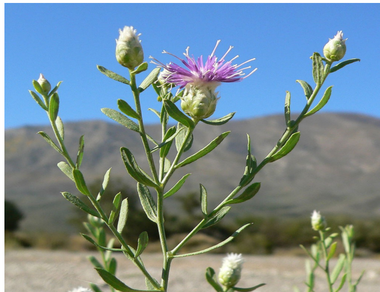
ABOVE: Russian knapweed