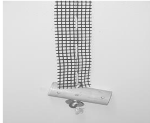
Figure 2. Image of a “Portland Sampler” substrate (Portland State University Center for Lakes & Reservoirs).